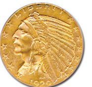
1929 $5 Indian