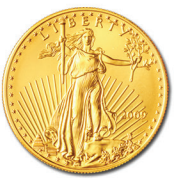
2009 $50 Gold Eagle