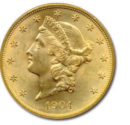
1904 $20 Liberty